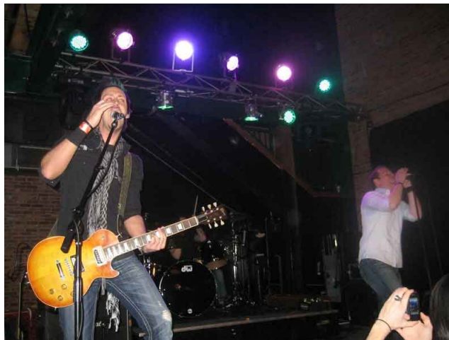
Starcrush Rocks Out with 90's and 21st century Rock Tunes!