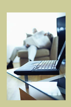
Sign Up to get Brain Matters eNewsletter