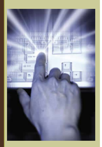
Read Archived Copies of Brain Matters